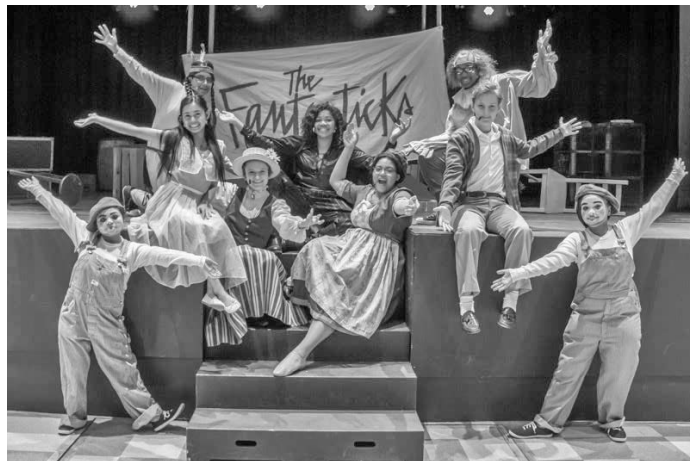
Students Perform in The Fantastics

Putting on two musicals year is expensive. The cost of licensing, props, lighting, etc., is not recovered through ticket sales and is a burden on Uni's budget and the Uni Hi Education Foundation's budget as well. If you participated in theater you remember the thrill and excitement of being on stage, the friends you made, and the appreciation of theater you still hold today. Now is your chance to give back. We need help. If you can make a financial donation to the theater program please do so now, and, if you still live in the Los Angeles area, come to our performances.