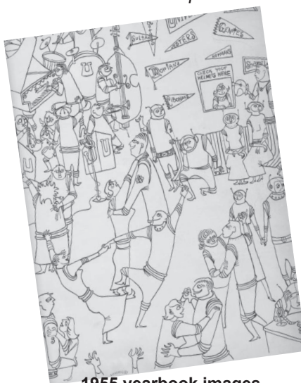
1955 yearbook images

A powerful anti-draft Ramparts cover created by Stermer led to a grand jury summons that accused the magazine editors of instigating civil disobedience. Eventually charges were dropped after Stermer's (and other editors') testimony led prosecutors to determine that public relations for the government might suffer from going after editors.