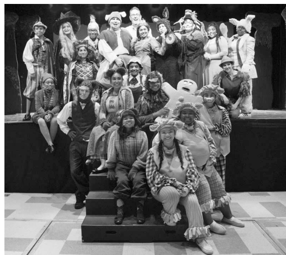
Shrek The Musical