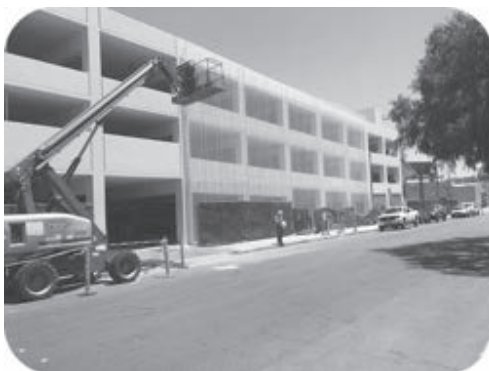
entrance on Westgate

Check out the pictures to see the future at work!