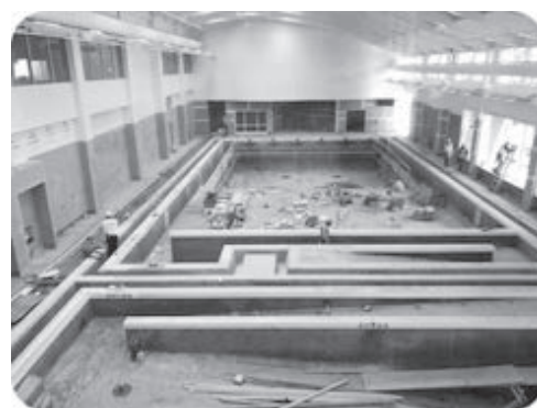
two swimming pools in aquatic center