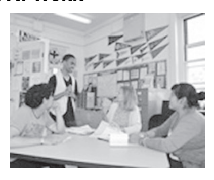
College-Career Center enjoys UHEF's gift of computers to plan for the future.