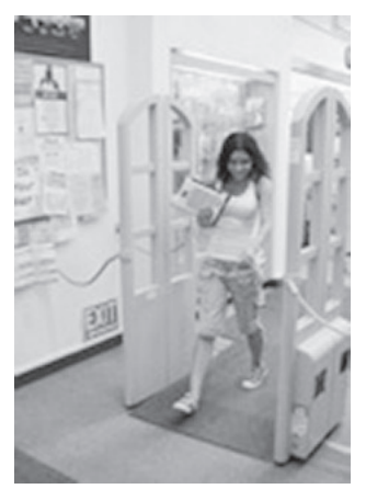
Student demonstrates new library security.