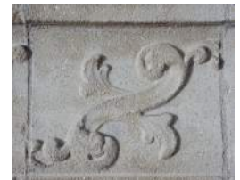
University High School - 1953